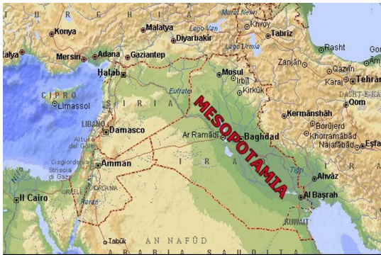
A contemporary map of Iraq and the surrounding region showing Mesopotamia (literally, "between rivers").