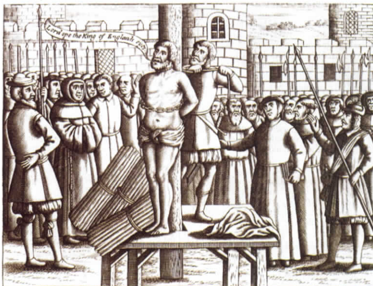
Writer and scholar Tyndale was burned at the stake for his Protestant views.

Tyndale was especially important for his translations of books from the Bible. To spread knowledge of the Bible, he translated the New Testament , and parts of the Old Testament , into English. In the early 1600s, his work was used in the preparation of the King James, or Authorized, Version of the Bible. Famed for its beautiful language, the King James Bible had an enormous influence on English worship and literature.