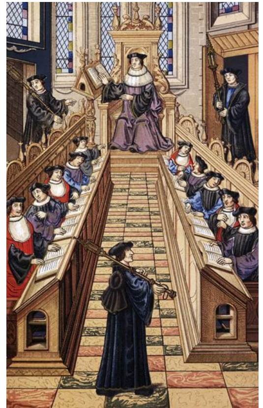
Students at the University of Paris wore scholars' caps and gowns. This illustration from 1400 shows some students carrying scepters of the Church.

Aquinas's teachings unified ancient philosophy and Christian theology. His teachings were later accepted and promoted by the Church.