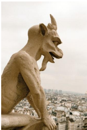
The gargoyles on Gothic cathedrals were often carved in the shape of hideous mythical beasts.

Gargoyles are a unique feature of Gothic cathedrals. Gargoyles are decorative stone sculptures projecting from the rain gutters or edges of a cathedral roof. They were usually carved in the form of mythical beasts. In medieval times, some people thought gargoyles were there to remind them that devils and evil spirits would catch them if they did not obey the teachings of the Church.