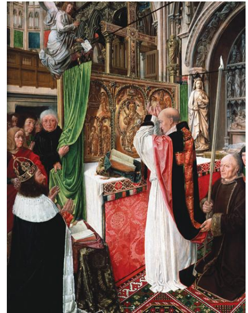
The Mass of Saint Giles was painted in about the year 1500.

In this chapter, you will learn how the Church began and how it grew. You will also discover how much the Church influenced people’s daily lives during the High Middle Ages.