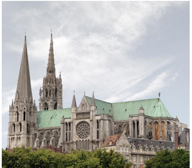
The construction of Chartres Cathedral in France began in 1194 and took 66 years to complete. Further additions spanned 300 years

The cathedrals built between 1150 and 1400 were designed in the Gothic style. Gothic cathedrals were designed to look like they are rising to heaven. On the outside are stone arches called flying buttresses . The arches spread the massive weight of the soaring roof and walls more evenly. This building technique allowed for taller, thinner walls and more windows.