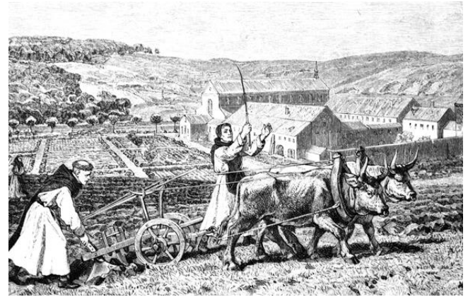
Work was especially important to Saint Benedict, who once wrote, "To work is to pray."

Men became monks for many reasons. Some were seeking refuge from war, sickness, or sinfulness. Some came to study. Some were attracted by a quiet life of prayer and service.