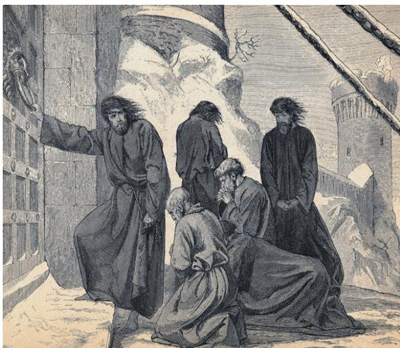
In the winter of 1077, the Holy Roman emperor, Henry IV, traveled to Italy to the castle of Canossa to beg forgiveness from Pope Gregory. Legend has it that the pope made Henry stand barefoot in the snow for three days before he forgave him.

The Increasing Power of the Church During the Middle Ages, the Church acquired great economic power. By the year 1050, it was the largest landholder in Europe. Some land came in the form of gifts from monarchs and wealthy lords. Some land was taken by force. The medieval Church added to its wealth by collecting a tithe, or tax. Each person was expected to give one-tenth of his money, produce, or labor to help support the Church.