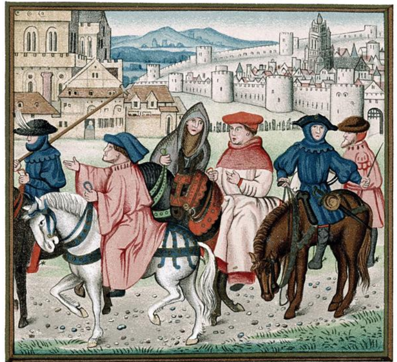
Pilgrims believed that their journeys of devotion earned them grace in the eyes of God. Beliefs such as this served to strengthen the power of the Church.

Some people went on Crusade to seek wealth, and some to seek adventure. Others went in the belief that doing so would guarantee their salvation. Many Crusaders acted from deep religious belief.