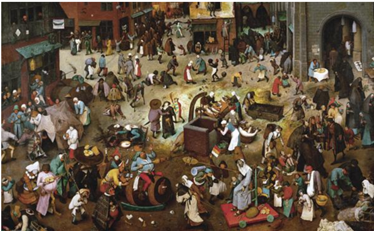
In the Middle Ages, Lent and Carnival were important holidays. Lent is a period of 40 days before Easter when Christians are especially pious and give up luxuries. Before the start of Lent, medieval Christians celebrated with a three-day festival, Carnival, shown here in a painting by Pieter Brueghel (BROY- gel) the Elder. Today, many Christians still celebrate Carnival and Lent before Easter.

Other favorite holiday entertainments included bonfires, acrobats and jugglers, and dancing bears. Plays were also popular. During religious services on special days, priests sometimes acted out Bible stories. By the 13th century, plays were often held outdoors in front of the church so more people could watch. In some English villages, mummers (traveling groups of actors) performed with masks, drums and bells, dances, and make-believe sword fights.