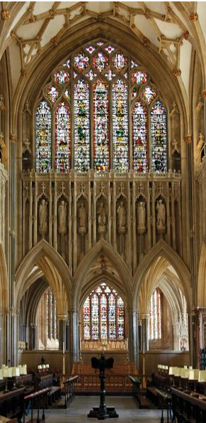
The interiors of medieval cathedrals, with their soaring arches and beautiful stained-glass windows, inspired and reinforced religious belief.

The Church was the center of life in medieval western Europe. Almost every community had a church building. Larger towns and cities had a cathedral. Church bells rang out the hours, called people to worship, and warned of danger.