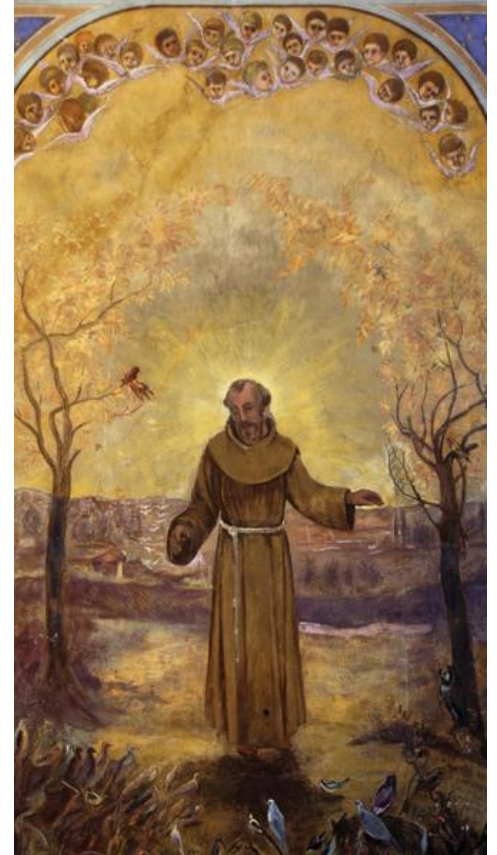
St. Francis of Assisi lived a simple life, with great love and respect for all living things. Here he is shown preaching to the birds.

Francis, who loved nature, believed that all living things should be respected. He is often pictured with animals. To many, his example of faith, charity, and love of God represents an ideal of Christian living.