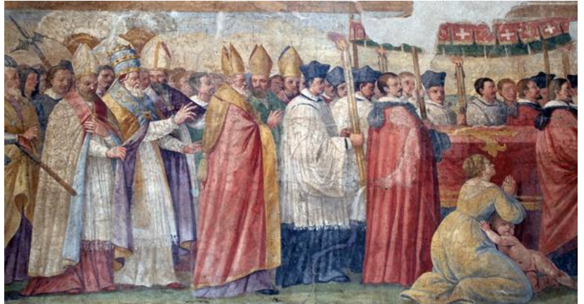
The pope is the most powerful official of the Roman Catholic Church. This painting of the procession of Pope Lucius III was created in the year 1183, and shows the pope, cardinals, archbishops, bishops, and priests in their various garments and finery.

At the start of the Middle Ages, all Christians in western Europe belonged to a single church, which became known as the Roman Catholic Church . After the collapse of Rome, the Church played a vital role in society. In part, it was one of the few ties that people had to a more stable time. The Church provided leadership and, at times, even organized the distribution of food. Monasteries, or communities of monks, provided hospitality to refugees and travelers. Monks also copied and preserved old texts, and in this way helped keep both new and ancient learning alive. The spread of monasteries and the preaching of missionaries helped bring new converts to the Christian faith.