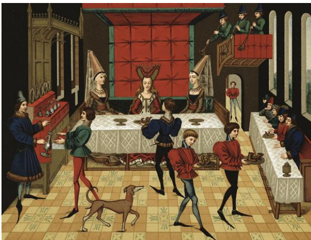
Lords and ladies were served elaborate meals at feasts or banquets. Often, musicians and jesters entertained them while they ate.