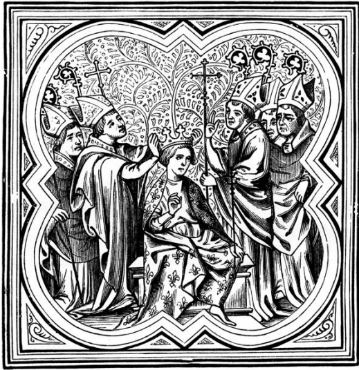
In 800 C.E., Charlemagne was crowned Holy Roman emperor by Pope Leo III.

One of the early leaders of the Franks was an ambitious young warrior named Clovis. In 481 C.E., at the age of 15, Clovis became leader of the Franks. Five years later, he defeated the last great Roman army in Gaul at Soissons. During his 30-year reign , he led the Franks in wars that greatly extended the boundaries of the Frankish kingdom.