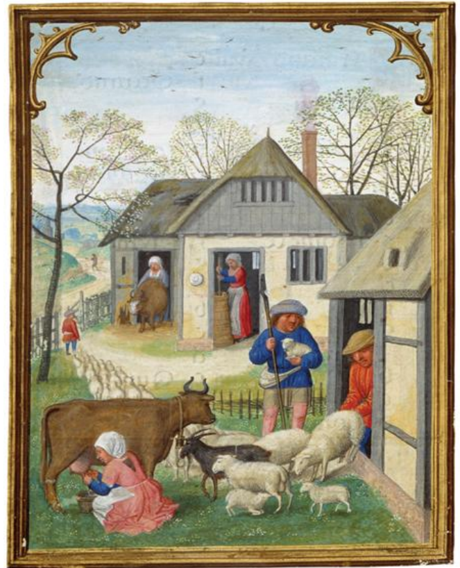
Peasants' homes were small and crowded with people and animals

Peasants ate vegetables, meat such as pork, and dark, coarse bread made of wheat mixed with rye or oatmeal. Almost no one ate beef or chicken. During the winter, they ate pork, mutton, or fish that had been preserved in salt. Herbs were used widely, to improve flavor and reduce saltiness, or to disguise the taste of meat that was no longer fresh.