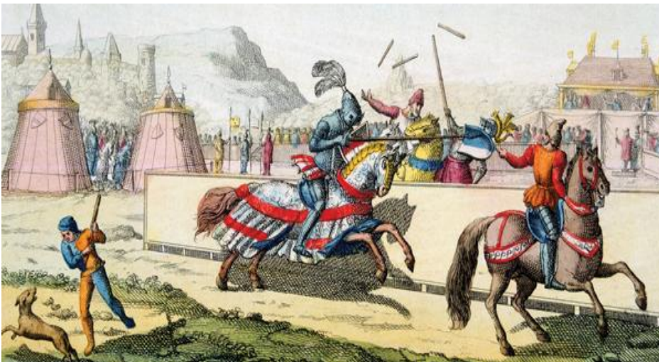
Knights in a joust tried to knock each other off their horses.

The Responsibilities and Daily Life of Knights Being a knight was more than a profession. It was a way of life. Knights lived by a strong code of behavior called chivalry . ( Chivalry comes from the French word cheval , meaning “horse.”) Knights were expected to be loyal to the Church and to their lord, to be just and fair, and to protect the helpless. They performed acts of gallantry, or respect paid to women. From these acts, we get the modern idea of chivalry as traditional forms of courtesy and kindness toward women.