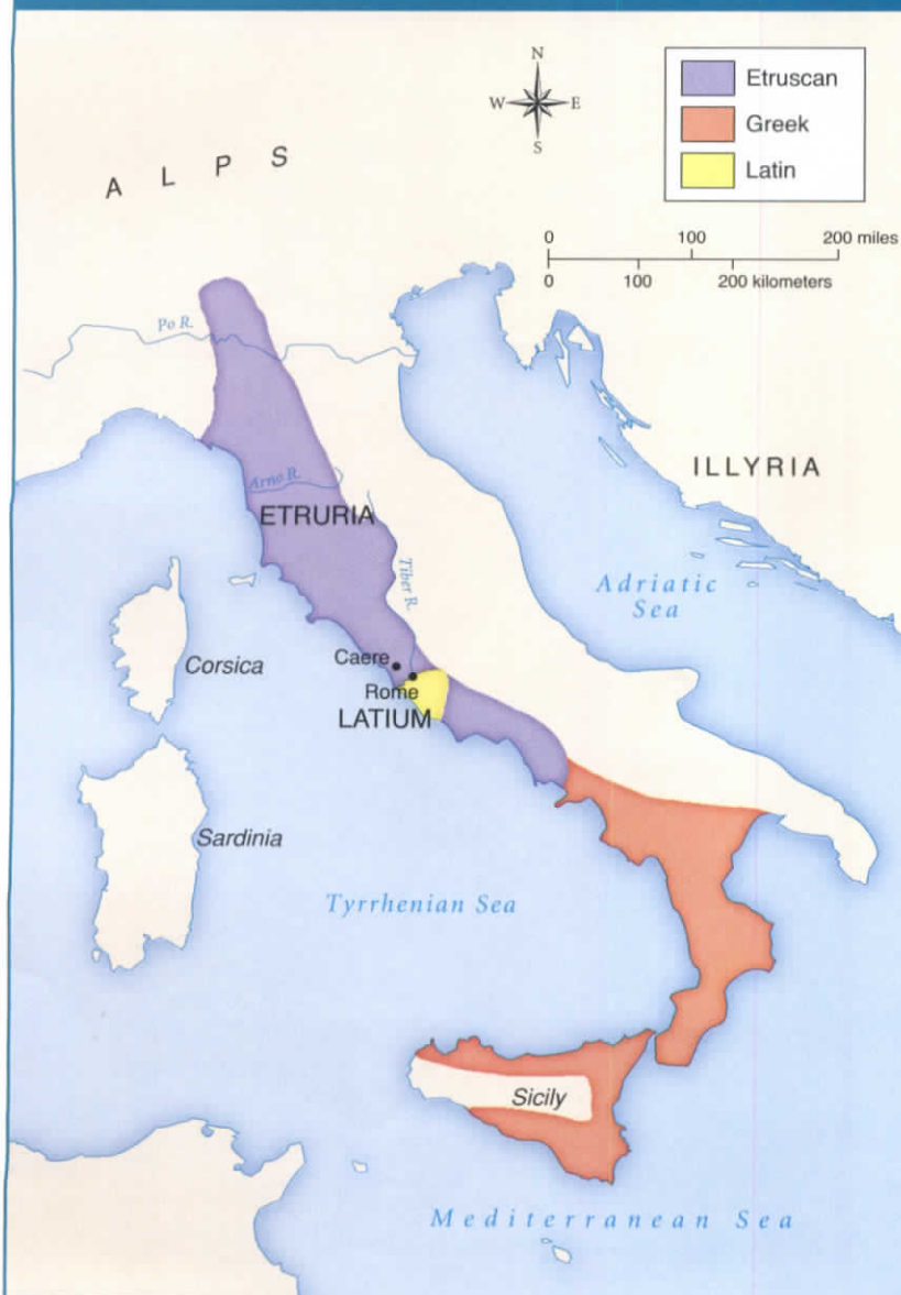
Mediterranean Region, Sixth Century B.C.E.

Let's look at some of the ideas and customs the Romans learned from these two groups.