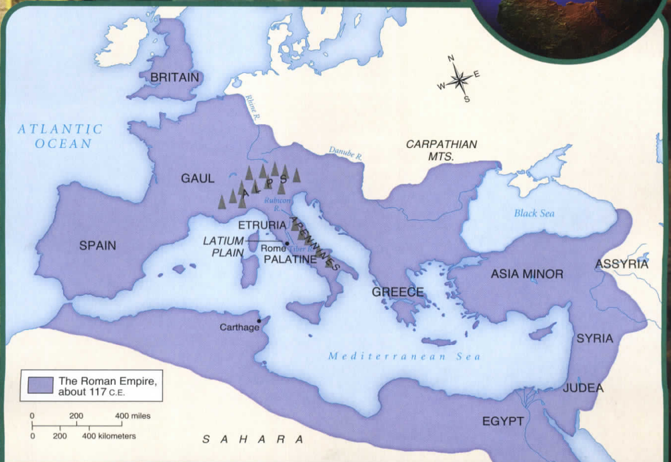
The Roman Empire, About 117 C.E.