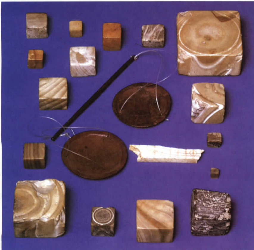
These stone weights were found in Mohenjodaro.